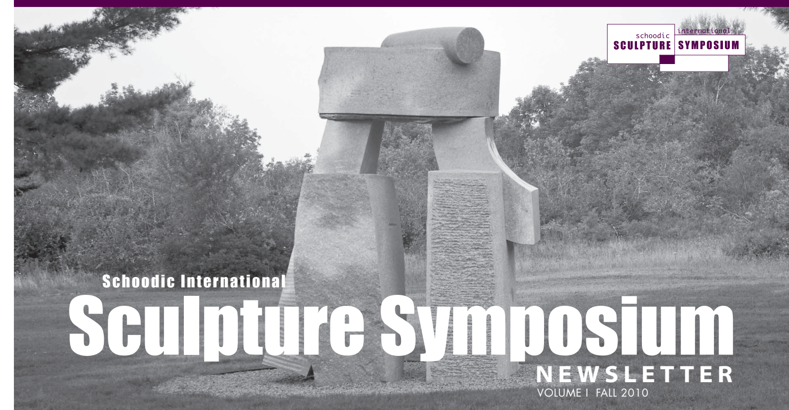
Dialog by Roland Mayer of Germany, which was created during the 2009 Symposium, was installed at Lamoine State Park on September 12, 2010.

Non-profit Organization US Postage PAID Ellsworth, ME 04640 Permit # 208